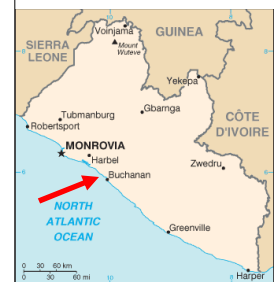
A map of Liberia. Buchanan is marked by red arrow