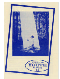
Restoration Youth Magazine

Brother Ludy will gladly help authors edit their material.