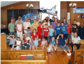
Vacation Space School group photo 2007