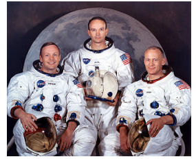
The crew of Apollo 11, Astronauts Neil Armstrong, Buzz Aldrin, and Michael Collins

We enjoyed our visitors and our friends who joined with us during the week. May the Lord bless each of you in your search for the Lord of the Universe.