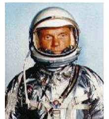
Astronaut John Glenn

July 18 was the 86th birthday of John Glenn.