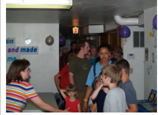
Astronauts entering the Galactic Galley