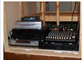
Audio equipment in the new audio cabinet